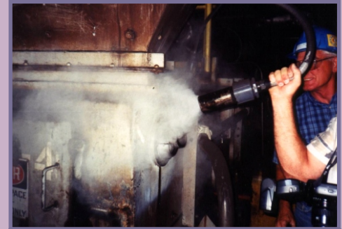
Easy to maintain Foggers

Consider a water droplet about to impinge on a dust particle, or what is aerodynamically equivalent, a dust particle about to impinge on a water droplet, as shown in the drawing. If the droplet diameter is much greater than the dust particle, the dust particle simply follows the air streamlines around a droplet, a little or no contact occurs. In fact, it is difficult to impact micron - size particle on any thing, which is why inertial separators do not work well at these sizes. If, on the other hand, the water droplet is of a size that is comparable to that of the dust particle, contact occurs as the dust particle tries to follow the streamlines.