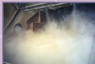
Dry Fog in Reclaim Feeder Discharge