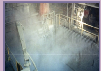
DUMP HOOPER - START OF DRY FOG