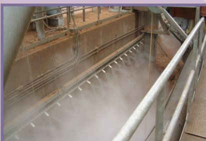
Fog Manifold along Tippler Hopper