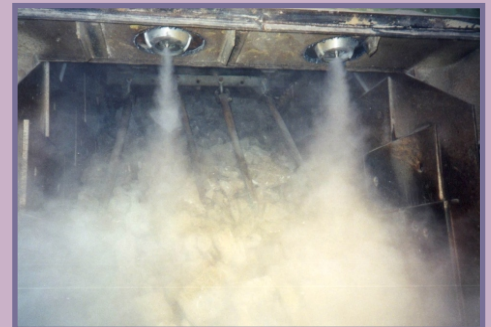
Inside view of transfer Chute at receiving point