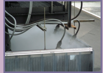
DRY FOG IN WAGON LOADING