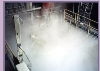
DUMP HOOPER - AFTER 60 SECONDS READY FOR UNLOADING